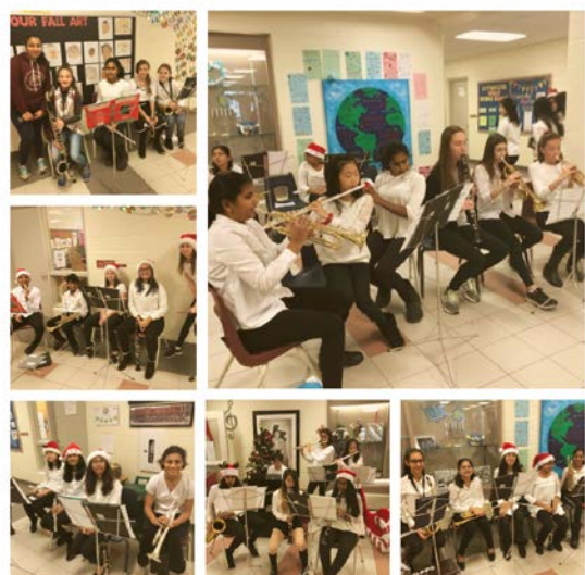
Winter Concert Night