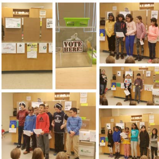
Grade 5 Elections

When the election took place they invited all the grade 5's and a grade 4 class to vote. Students voted behind a polling station, on a "official" ballot. A group of students counted and recounted the ballots. Two groups ended up with a tie, so they decided to combine their platforms and share the role of PM. They have promised the class a more achievable Dojo goal and to start a "suggestion cup" in the classroom.