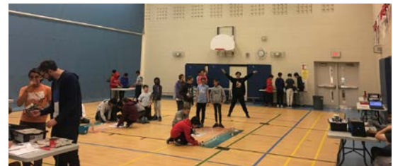
Robotics Club in Action